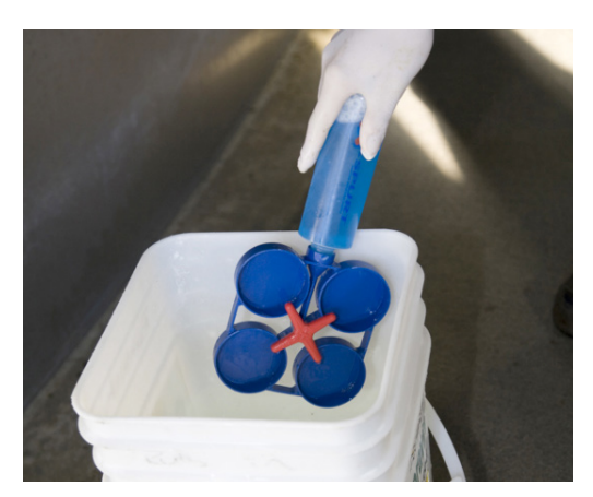
Step 6: Tip milk out of paddle and wash in a bucket of water to remove remaining residues before testing next cow.

Step 7: If positive, mark the cow with spray paint identifying the positive quarter to monitor.