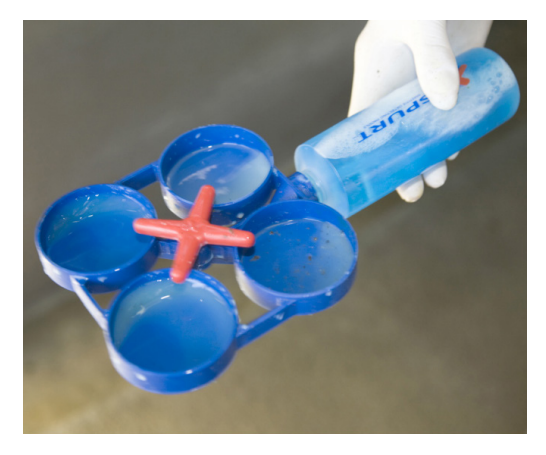
Step 4: Add equal parts of RMT reagent to milk (squeeze) and mix by swirling or rocking the paddle for 10-15 seconds.