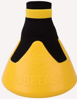
Yellow - 175mm (7 inches)

Please note the dimensions below indicate the maximum internal diameter of the Tubbease, not the diameter of the hoof. Tubbease can also be fitted over horse shoes.