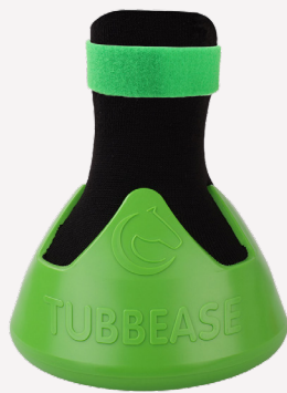
Green - 130mm (5 1/8 inches)