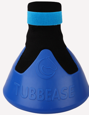
Blue - 160mm (6 1/4 inches)