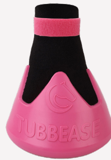
Pink - 110mm (4 1/2 inches)