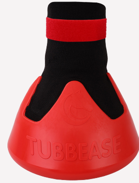
Red - 145mm (5 1/2 inches)